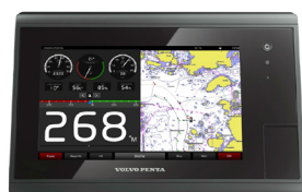
Volvo Penta Multifunction display