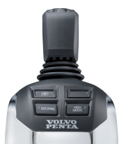
Joystick for Volvo Penta IPS